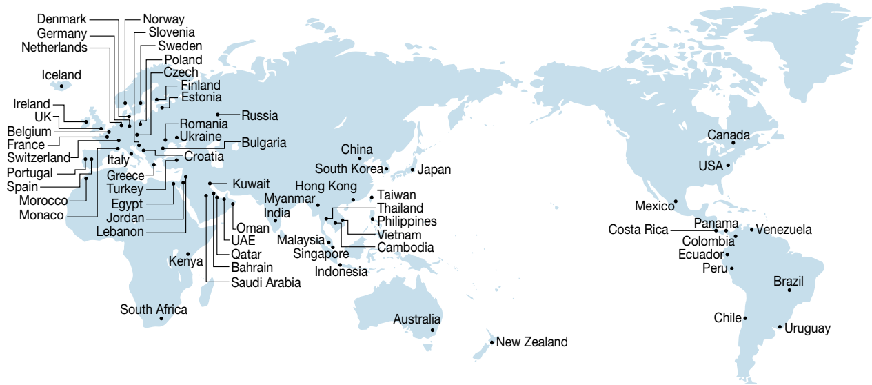
As of July, 2019